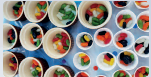
Sugar rush? Officeworx fuel the Cheltenham Challenge Half Marathon runners with jelly beans, crisps and oat bars!