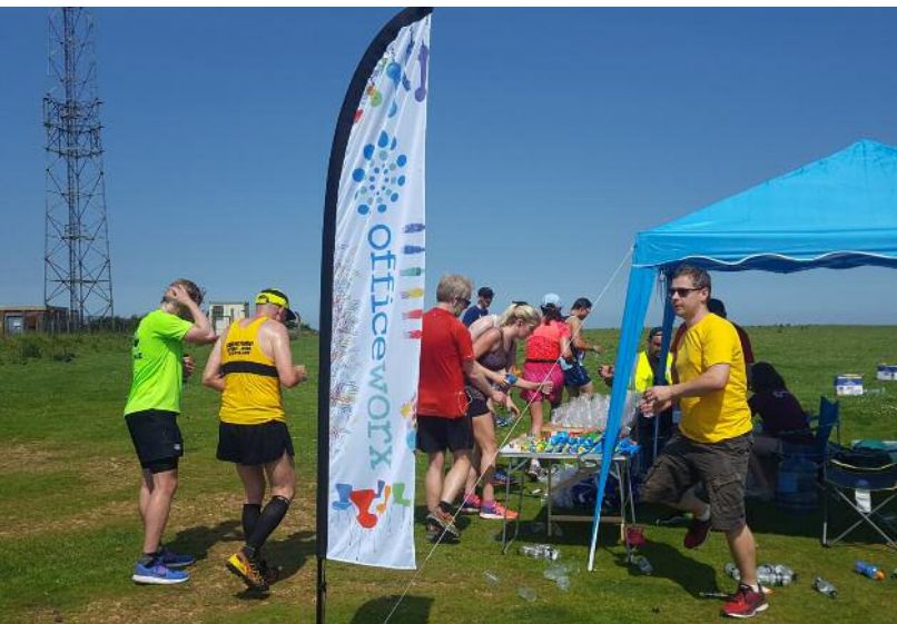
The Officeworx water station